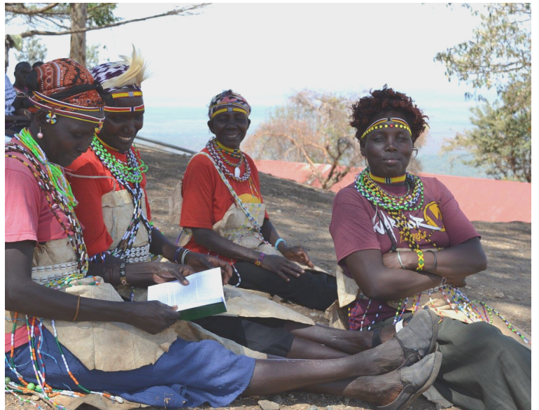
Marakwet ladies excitedly peruse through the Book of Genesis in their language during its dedication