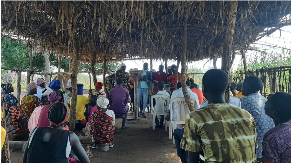
A Sunday service at Sudan Interior Church

3. Gorowa & Nyamusa, Molo and Koma projects - BTL's Beyond Kenya start ups based in Tanzania and South Sudan respectively. Sociolinguistic surveys were carried out between the year 2022 – 2023. Projected language development and translation start dates in 2024.