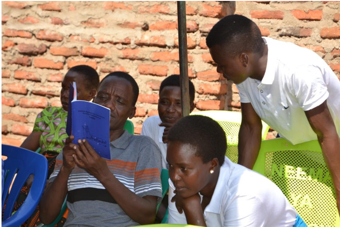
Gitemi speakers interact with the Gospel of Luke in their language

Gitemi Project . BTL's first Beyond Kenya Project based in Tanzania. Translation work had initially started under SIL missionaries but stalled. BTL picked up from where it had been left off in July 2021. The Gospel of Luke and the Jesus film were completed and launched in July 2023.