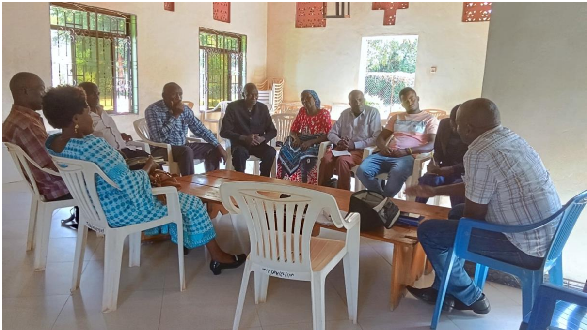
Gweno Project Advisory Committee Meeting

2. Gweno and Kahe projects –These are start-up projects that BTL is undertaking in Tanzania. Sociolinguistic surveys and community engagements have already been carried out. Projected translation start date in April 2024.