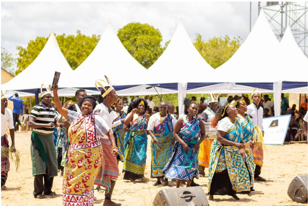
A Pokomo choir makes a presentation during the dedication and launch.

Translation work started in 1985. New Testament dedicated and launched in 2005. Complete Bible dedicated and launched in September 2023.